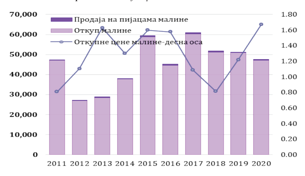
Graph 2. Purchase of raspberries and sales at markets

Graph 2 and Table 6 show the values of raspberry sales and purchases, market sales and raspberry purchase prices for the period 2011-2020.