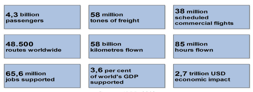
Figure 1. The contribution of the global aviation industry

During 2018, airlines worldwide transported about 4.3 billion passengers and 58 million tons of cargo (Figure 1). Every day, more than 100,000 flights carried nearly 12 million passengers and goods worth about $ 18 billion. Historically, air traffic has doubled every fifteen years and is growing faster than most other industries (Palmer, 2016). According to the estimates of the Air Transport Action Group (ATAG, 2019), the total economic contribution of global air traffic in 2016 amounted to 2.7 trillion dollars, which is 3.6% of world GDP. Air traffic also supports a total of 65.5 million jobs worldwide and provides 10.2 million direct jobs. Airlines, airports and air traffic control and navigation service providers directly employ about 3.5 million people. The civil aviation sector (aircraft, systems and engines) employs 1.2 million people. A further 5.6 million people are employed in other positions at airports, and 55.3 million jobs are supported indirectly, induced in tourism as well (ATAG, 2019).